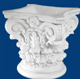
103 Kapitel 45 x 45 x 45 cm